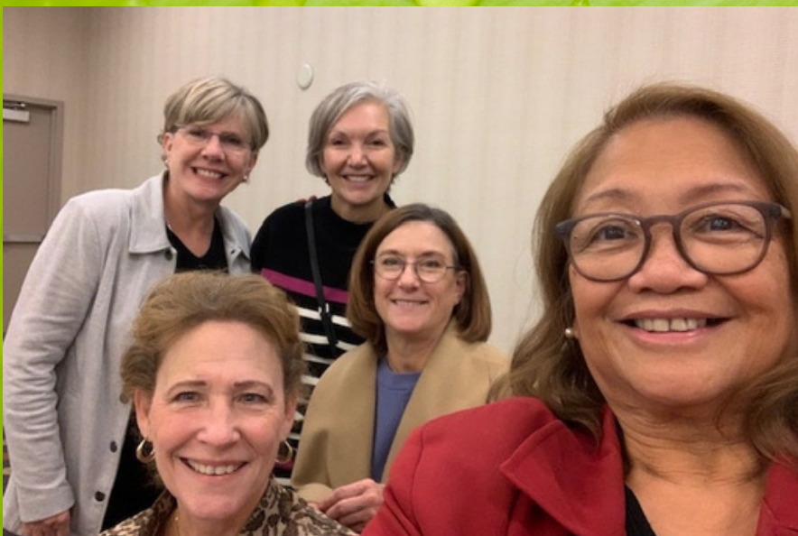
These lovelies attended the Clothes for Kids breakfast.