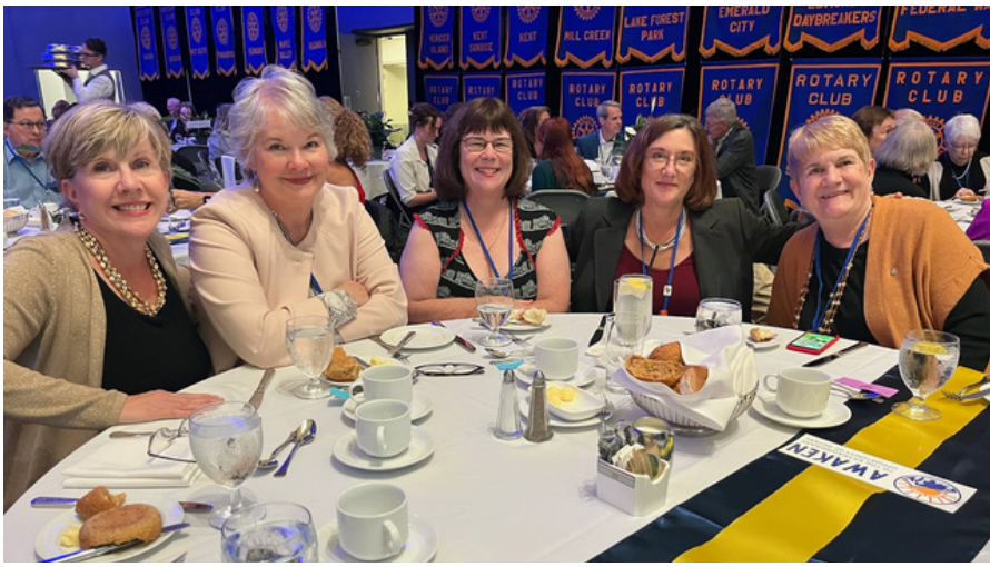
Saturday night dinner